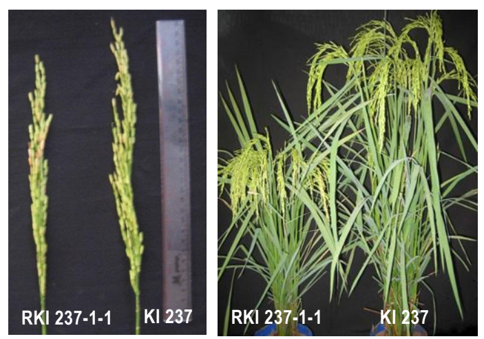
Fig. 3. Morphological characterization of semi-dwarf mutant RKI237-1-1 and its original plant, KI237.