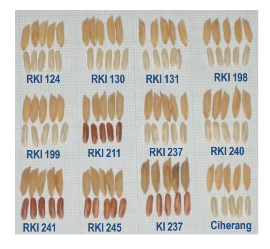
Tabel 4. Amylose contents and phericarp color of selected RKI lines.