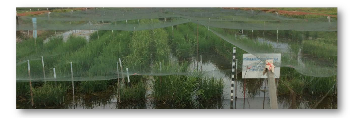
Figure 4. Protection of 317 mutant lines from bird damage by nets.

Figure 3. Submergence tolerant mutants lines from field screening.