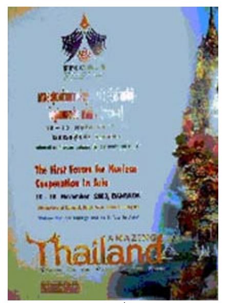
Poster of 1st FNCA