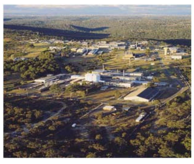
Aerial View of ANSTO

Another project is under way to convert this solid waste into a more durable waste form suitable for long term storage or disposal. Laboratory scale testing established the feasibility of producing Synroc with a high waste loading and its performance advantage over cement.