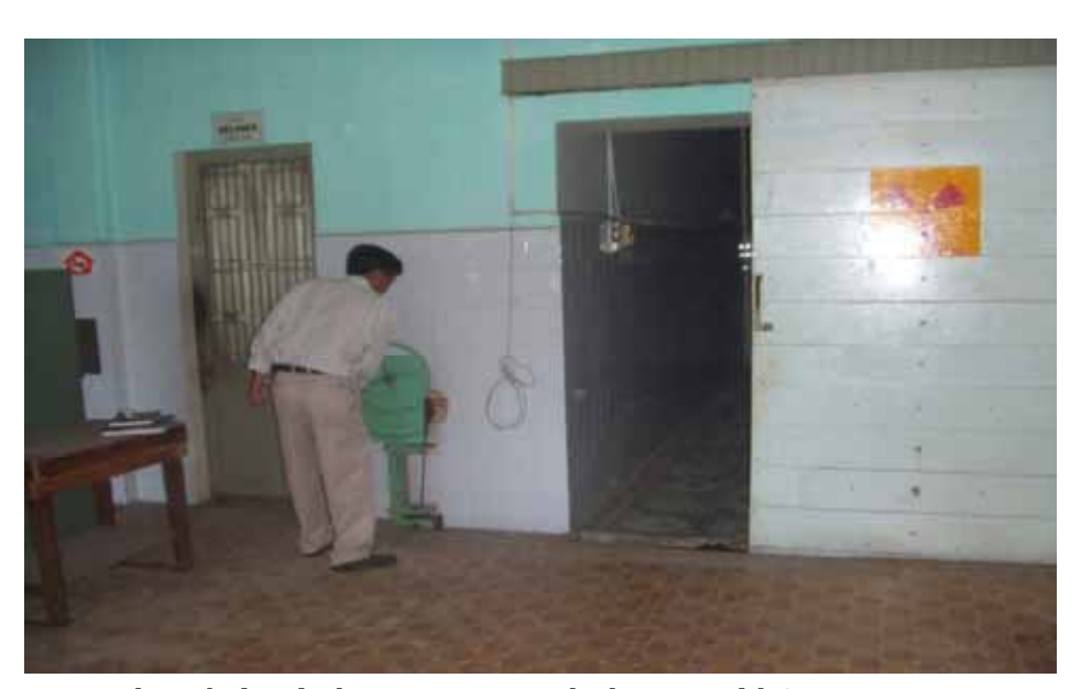
The cobalt teletherapy room with the very old Co-60 source

In future the hospital will build a new Oncology Center and will purchase 2 new linacs of Phillip and 1 Co-60 teletherapy equipment from Canada. This is funded by an American NGO named East meets West Organization.