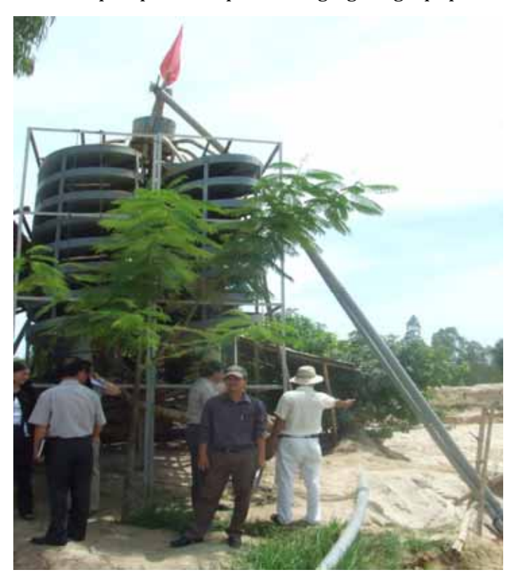
Sand segregating system