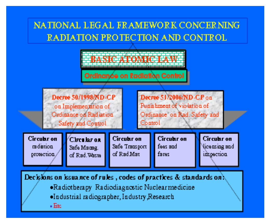
Fig. 1 Vietnam Legislative framework concerning radiation protection and control