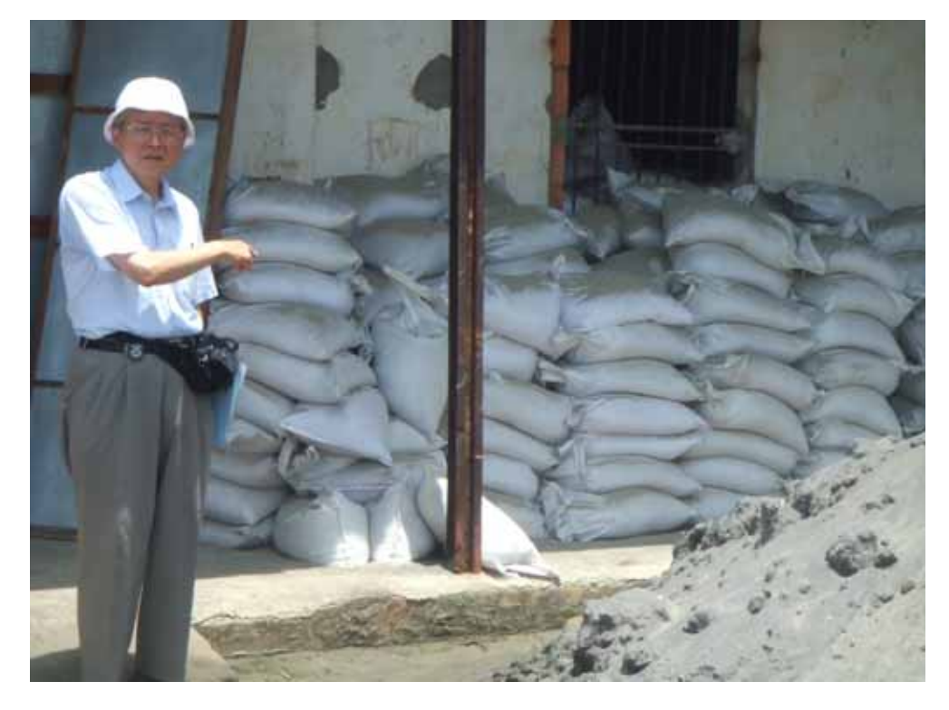
The storage of finished monazite product