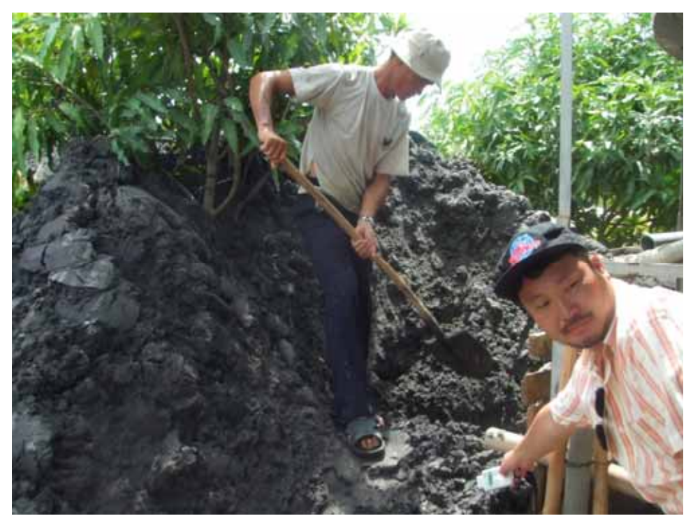
Black sand after primary segregation