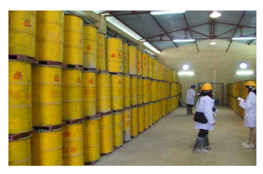
Temporary Radioactive Waste Storage at Phung

The Center has a plan to re-build with the layout divided into 3 areas: Uranium Processing Pilot Plant and R.W. storage (radioactive areas) and the ZnO production area (non-radioactive area). Plans for decommissioning and clearance of Monazite Pilot Plant haven't been set up yet.