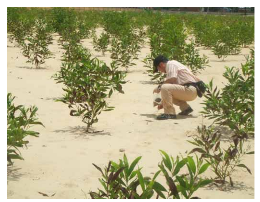
The view of site after returning the remaining sand and vegetation