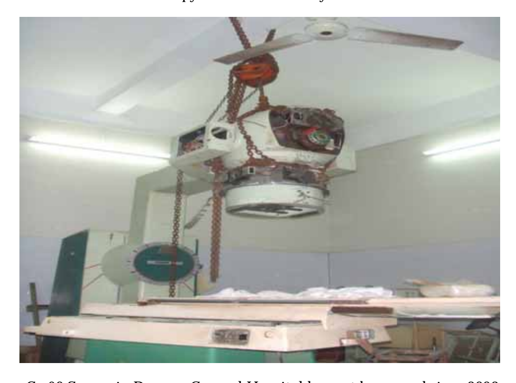
Co-60 Source in Danang General Hospital has not been used since 2002