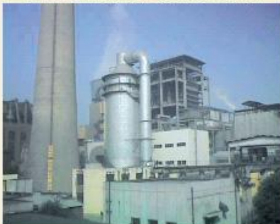
Flue Gas Treatment at Electric Power Station, Chengdo, China