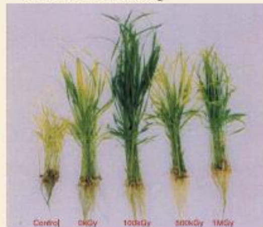
100k Gray Irradiation is Most Effective!