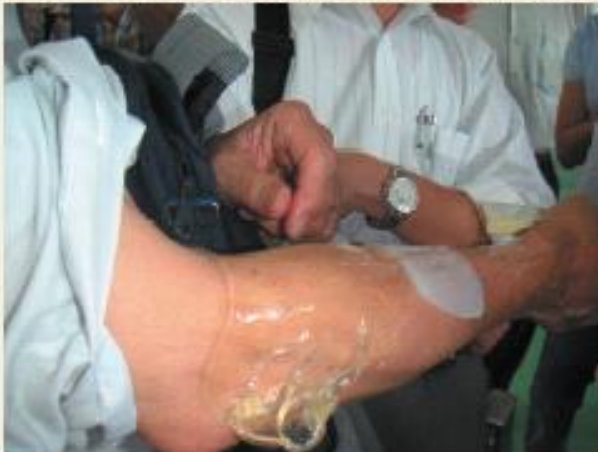
Hydrogel made of Natural Polymer by Radiation Modification MINT, Malaysia