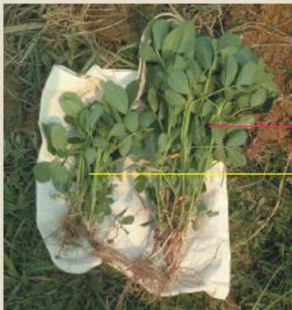
Province Vinh Puc (Vietnam Agricultural Science Institute, Viet Nam)